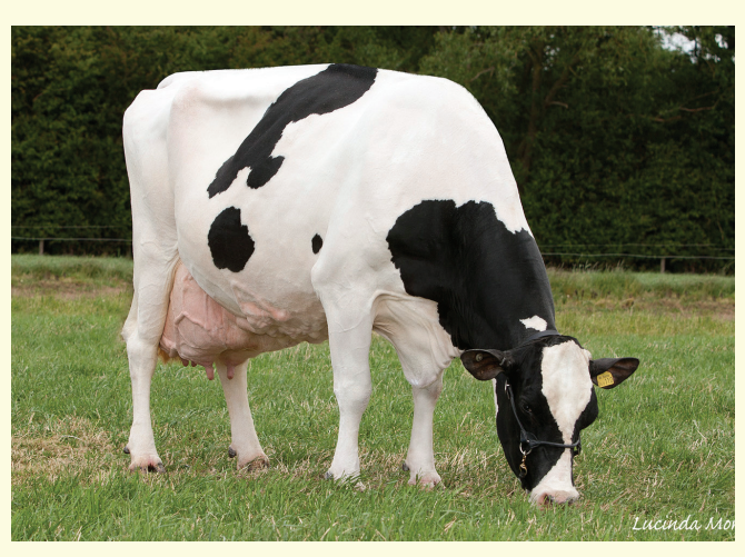
THE JOURNAL APRIL 2012 41

RIGHT Kingspool Jocko Roma EX92 (6E) 3 brood stars LP100 Averaging 12,641kgs, 3.43%F, 3.10%P.