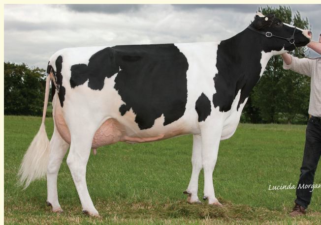
THE JOURNAL APRIL 2012 43

Kingspool Spirte Roma 2 VG88 (Gdam: Kingspool Jocko Roma EX92 (6E)).